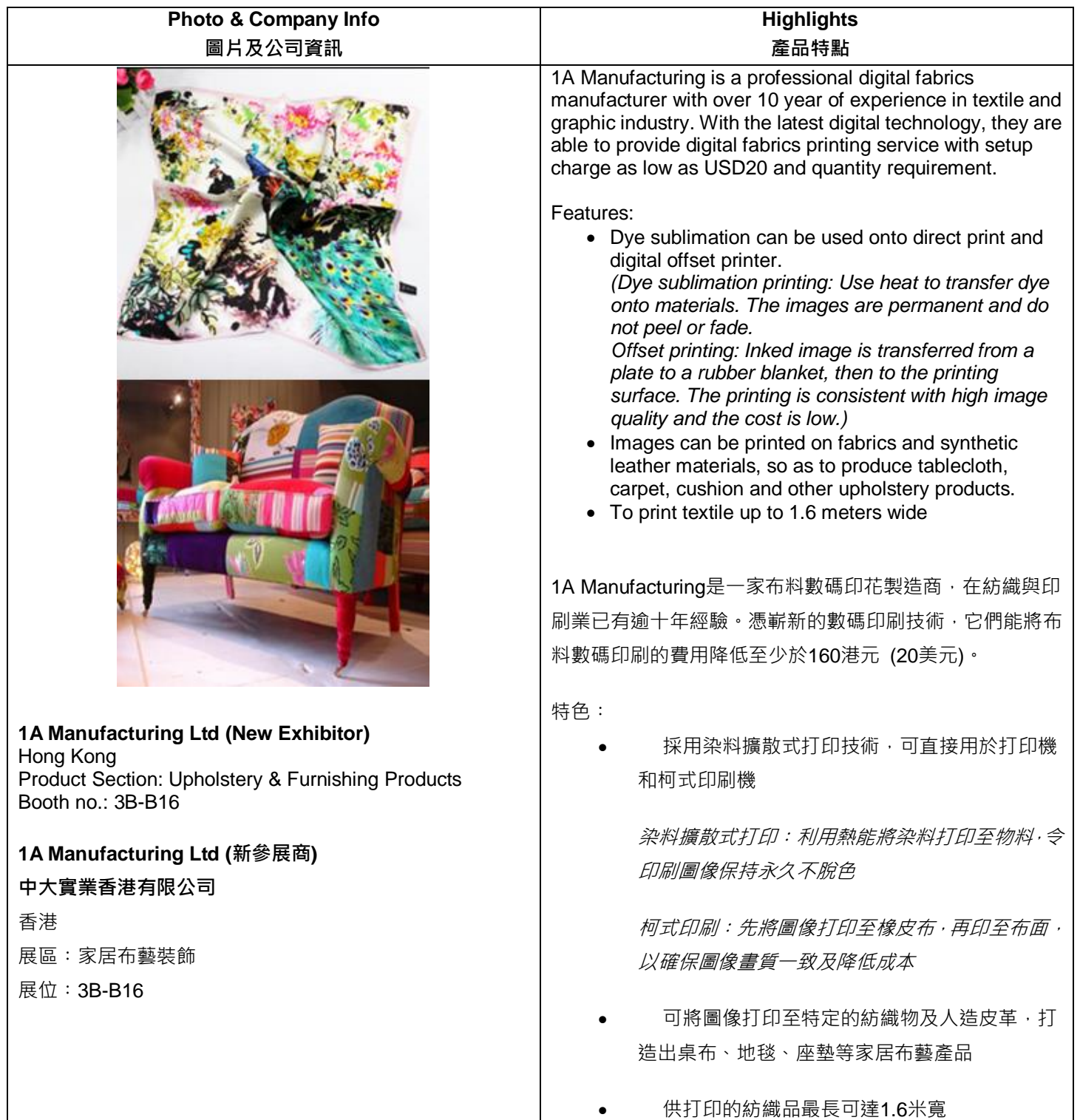
Photo Download Link: http://filesharing.tdc.org.hk/hktdc/download.php?fid=_phpqBTlrX